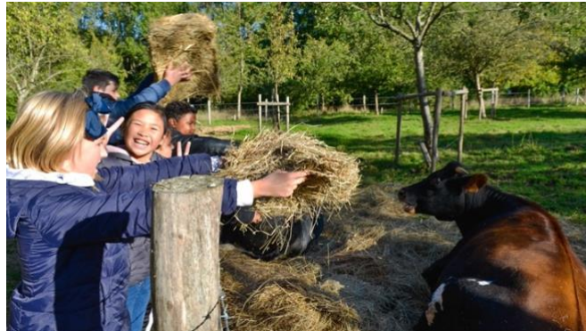
Photo credits: Left: Whole area of the museum, Photo: Mario Prevolnik © Graz Museum Schlossberg / Right: Heritage in action. Participation local schools Photo: Tine De Wilde ©