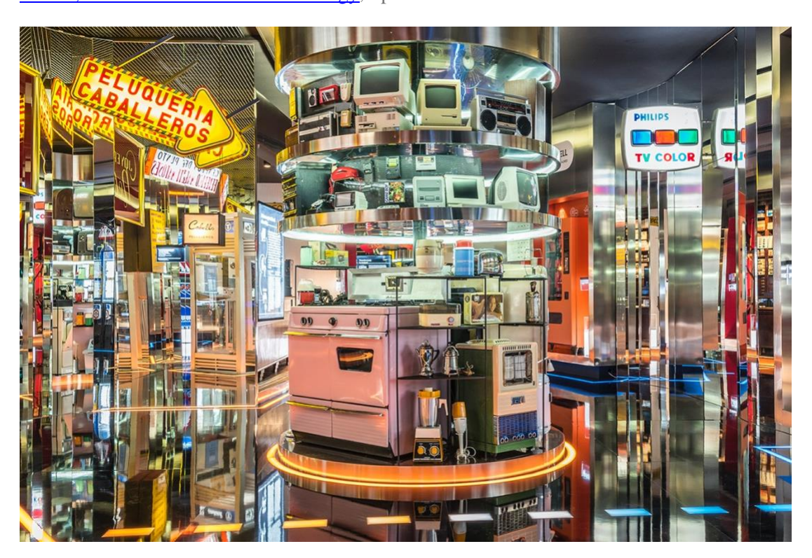
Photo credit: Permanent exhibition "Not Easy to be Valencian". The City: Global and Local. Tower of electrical appliances. Author: Hector Juan © L'ETNO

The Winner of the EMYA - European Museum of the Year Award 2023 L'Etno, Valencian Museum of Ethnology, Spain