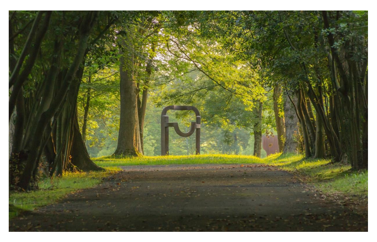
General view of the museum with Arco de la Libertad (Arch of Freedom) in the background.

The Winner of the Portimão Museum Prize for Welcoming, Inclusion and Belonging 2023 Chillida Leku, Spain