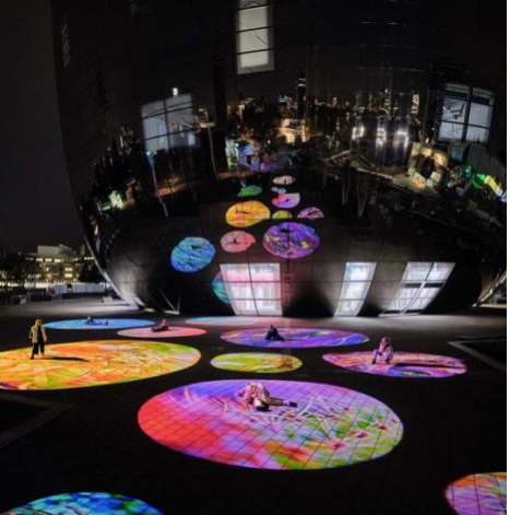
Left: View from the north-east / Right: Depot by night installation Pipilotti Rist.