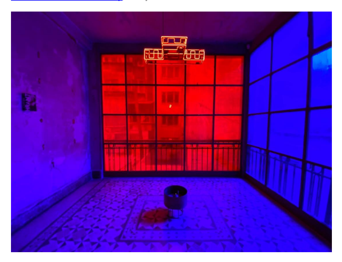
Photo credit: "Salt and Light" installation created by Sarkis based on the metaphor of "creating diamonds from pain" © 23,5 Hrant Dink Site of Memory