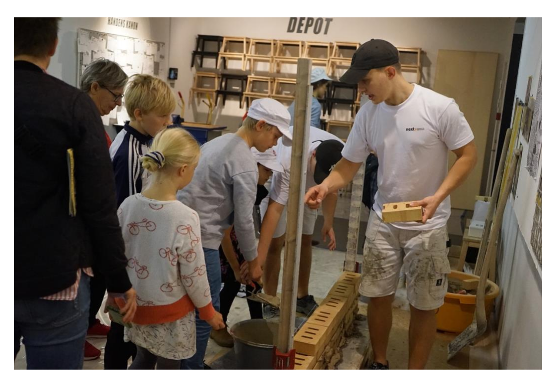
"Bricklayer for a day" event: Family-oriented holiday event at The Workers Museum involving bricklayer apprentices.