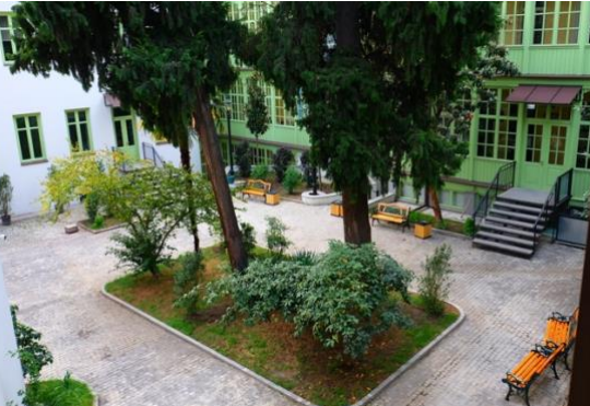
Left: "Normal + Me 2" / Right: Inner Façade and yard of the Museum